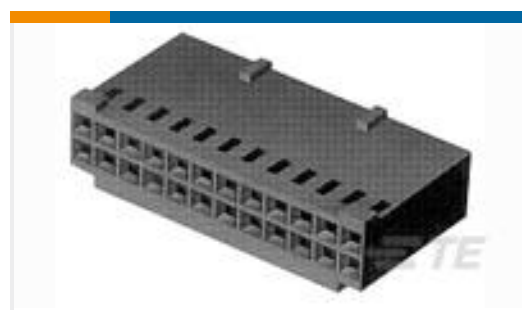
TE Part # 4-87977-8 50 MODIV HSG COMP DR .100 POL