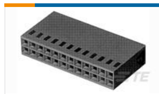
TE Part # 3-87456-9 50 MODIV HSG COMP DR .100CL