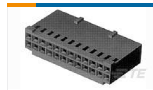
TE Part # 2-87977-1 50 MODIV HSG DR MRKD .100 POL