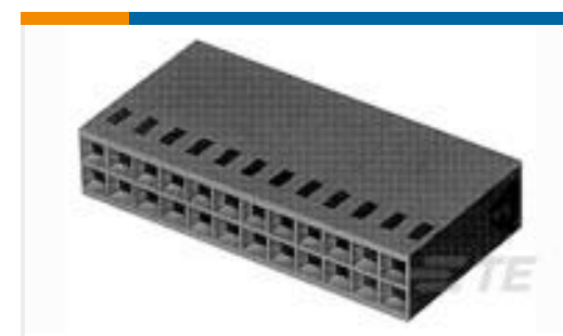
TE Part # 2-86177-1 50 MODIV HSG COMP DR .100CL